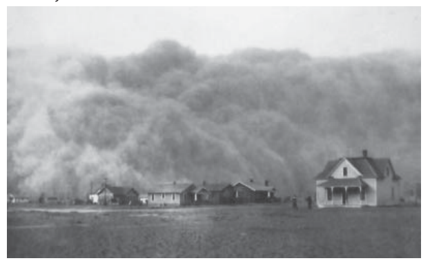
Figure 9.1. A Dust Storm Approaches Stratford, Walking in the Face of a Dust Storm in Texas, in 1935