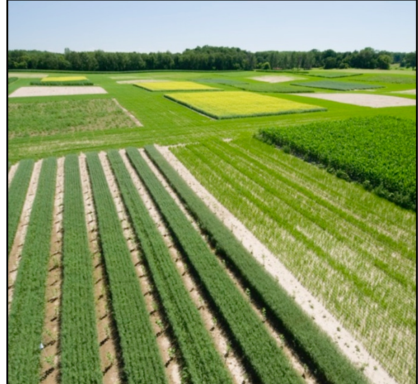
An aerial view of the experiment at MSU where biofuel crops are grown.