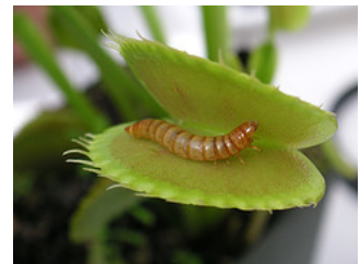
Venus flytrap catching its prey.

A unique plant, known as the Venus flytrap, captures its food with the use of tiny hairs that are triggered on the plant. When the prey, such as small insects and spiders, walk on the surface, the tiny hairs trigger the trap to close. Enzymes within the plant begin to break down the prey and ingest the nutrients from the insects. Although Venus flytraps obtain nitrogen from the insects they catch, they still require photosynthesis for other nutrients. Even though this plant is carnivorous, it is still an autotroph.